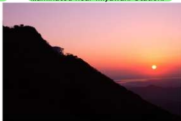
The first sunrise of the year from the peak of Mt. Tsukuba. About 6:44 a.m.