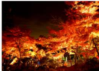
Around 100 Japanese maple trees illuminated near Miyawaki Station.