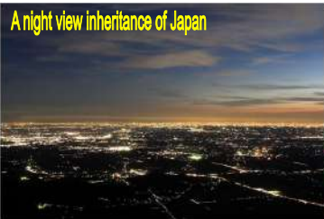
A night view inheritance of Japan