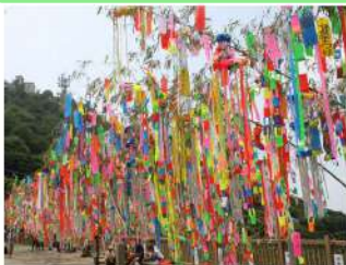
In summer, Tanabata ornaments dancing in the Tsukuba breeze.